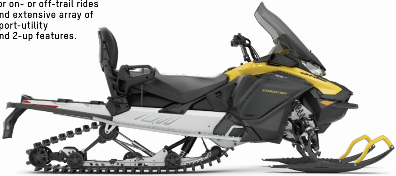
EXPEDITION SPORT 900 ACE SHOWN

Ultra-responsive chassis for on- or off-trail rides and extensive array of sport-utility and 2-up features.