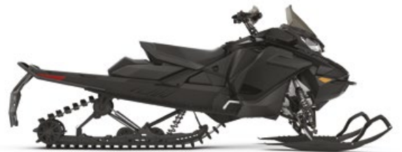
BACKCOUNTRY™ 850 E-TEC® SHOWN