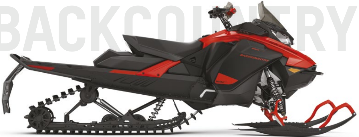
BACKCOUNTRY™ 850 E-TEC® SHOWN