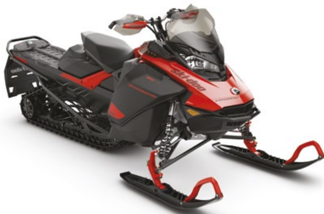
BACKCOUNTRY™ 850 E-TEC® SHOWN