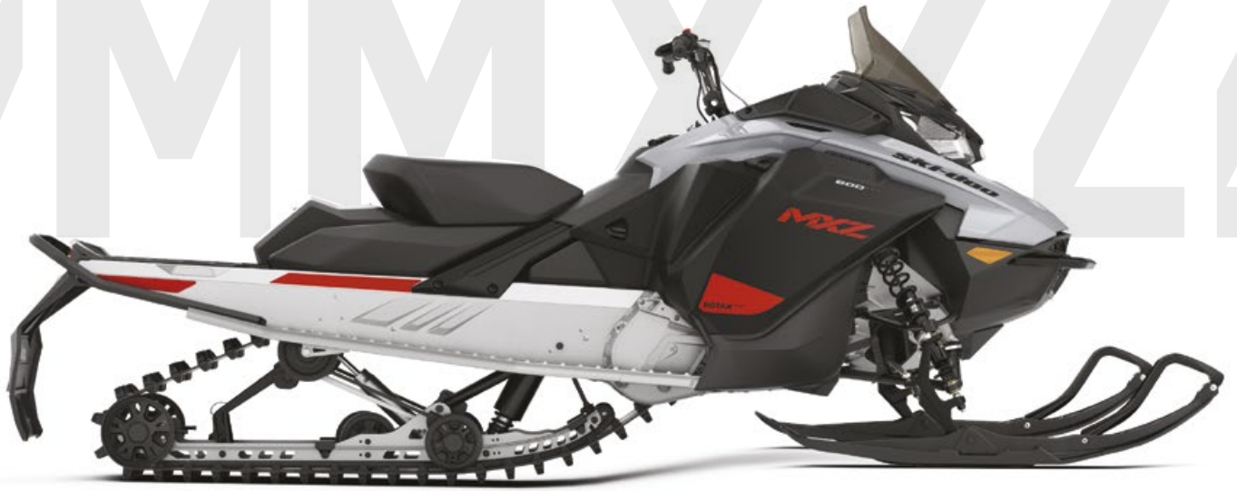
MXZ® SPORT SHOWN