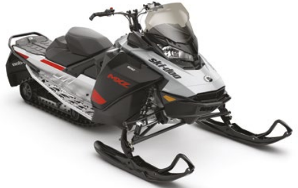
MXZ® SPORT SHOWN