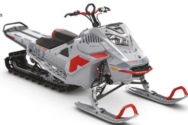
FREERIDE™ 165 850 E-TEC® TURBO SHOWN