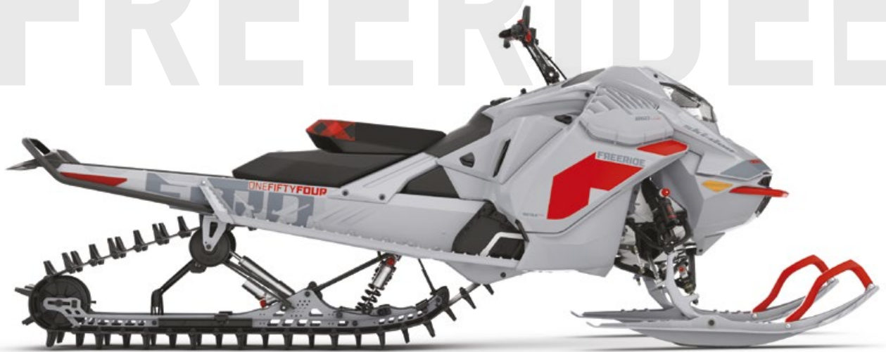
FREERIDE™ 154 850 E-TEC® TURBO SHOWN