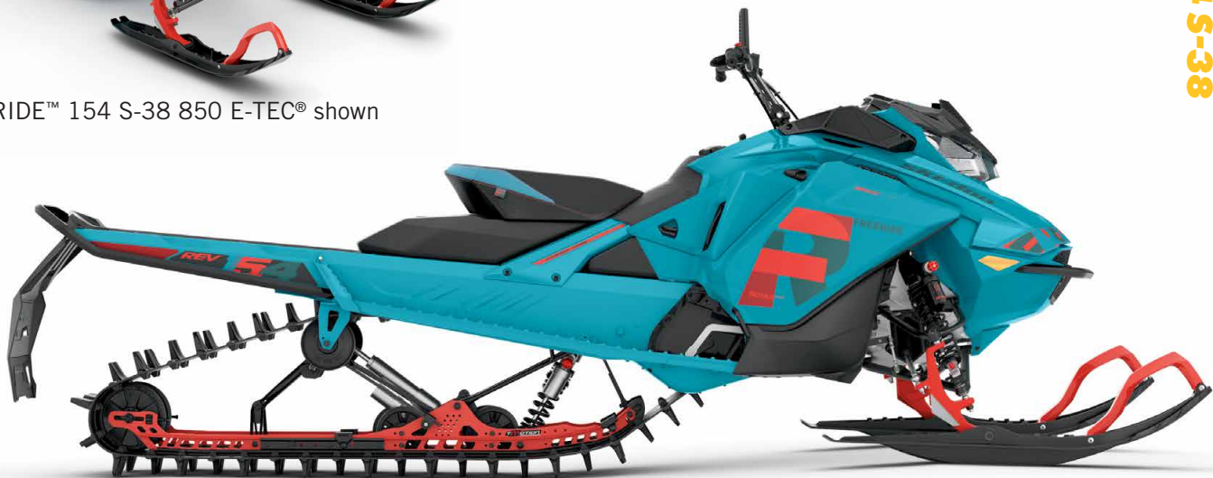
FREERIDE™ 154 S-38 850 E-TEC® shown