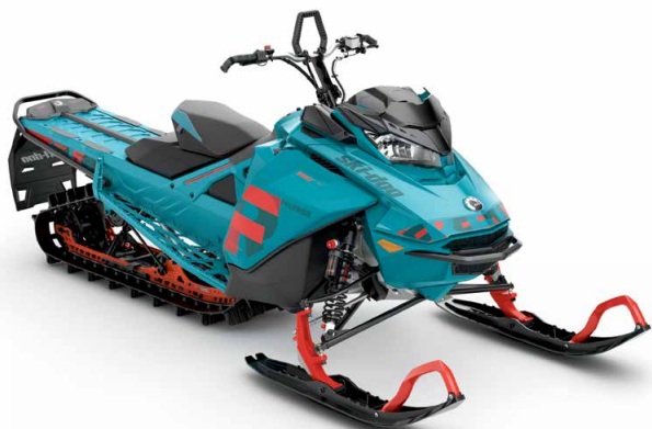
FREERIDE™ 154 S-38 850 E-TEC® shown